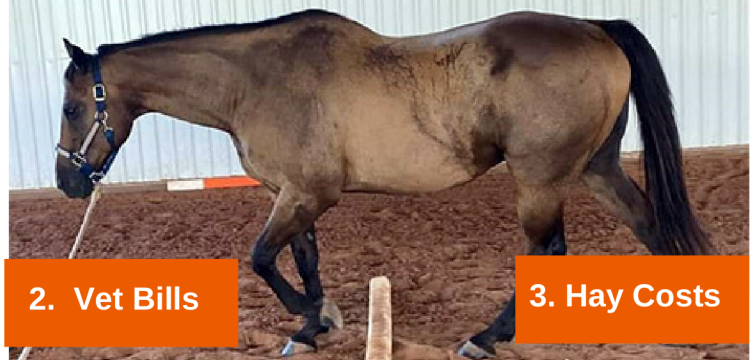
2. Vet Bills