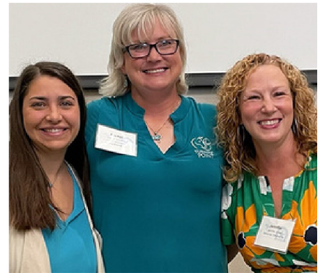
Turning Point team presented on Community Partnerships.

At the 2022 PATH Region 8 Conference , the team heard a Keynote Speech by Dr. Temple Grandin and made a presentation on the partnership as an active engagement site with OSU's Developmental Disabilities class