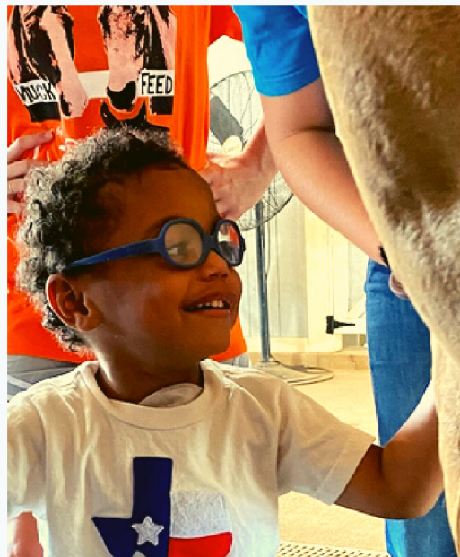
Ty's confidence is as tall as Derby!

Delivery is expected in time for Homecoming, October 22. First come first served in the Turning Point office.