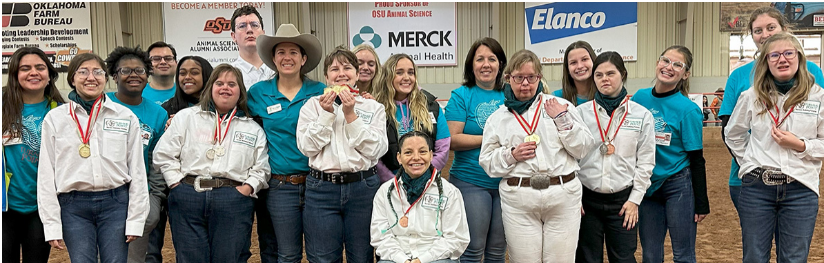
The WHOLE Team celebrates the partnership of riders, horses and great volunteers!