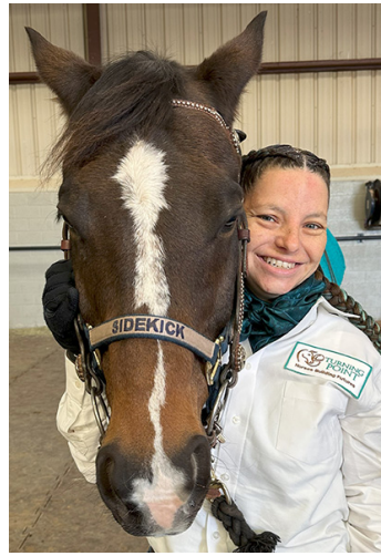
Nikki and Sidekick competed in Trail and Pole Bending.